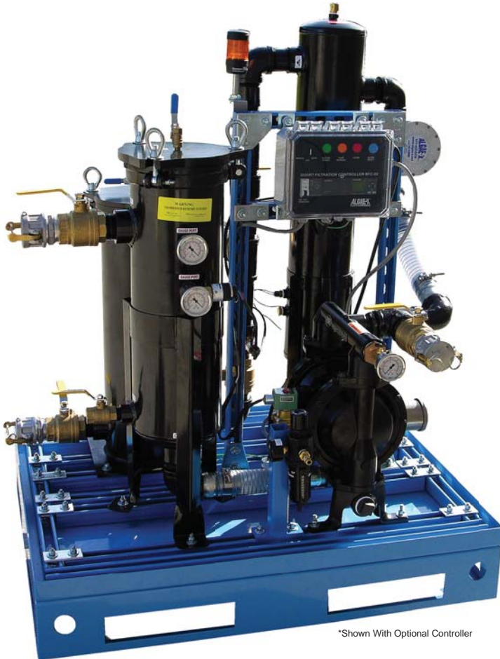
*Shown With Optional Controller

AXI’s mobile tank cleaning systems excel in combining High Capacity Filtration & Water Separation with Compact Design and Low Operating Cost to provide Optimal Fuel Quality for Peak Engine Performance and Reliability.