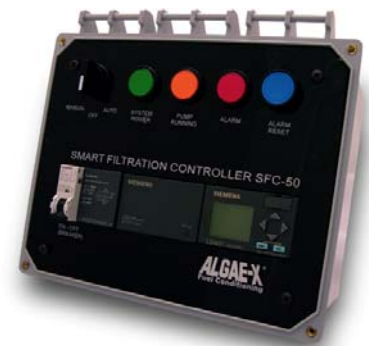
SFC-50 Smart Filtration Controller

The three color-coded lights give an instant visual status report of system power (green), pump running (orange), and alarm (red). The alarm reset is the easily accessible large (blue) push button. The selector switch provides the option of manual operation or running the fully automated program.