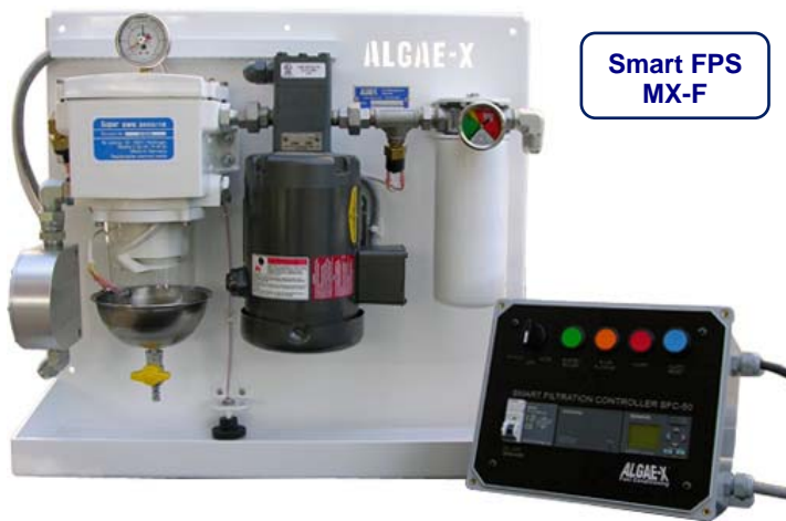
Smart FPS MX-F

Smart FPS Fuel Polishing Systems are equipped with a plug and play SFC-50 Smart Controller with text display.